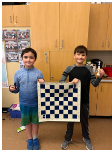
Pictured above: The Champions